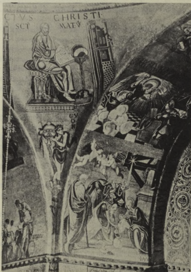
FIGURE 1. One of the four spandrels of St Mark's; seated evangelist above, personification of river below.

The design is so elaborate, harmonious and purposeful that we are tempted to view it as the starting point of any analysis, as the cause in some sense of the surrounding architecture. But this would invert the proper path of analysis. The