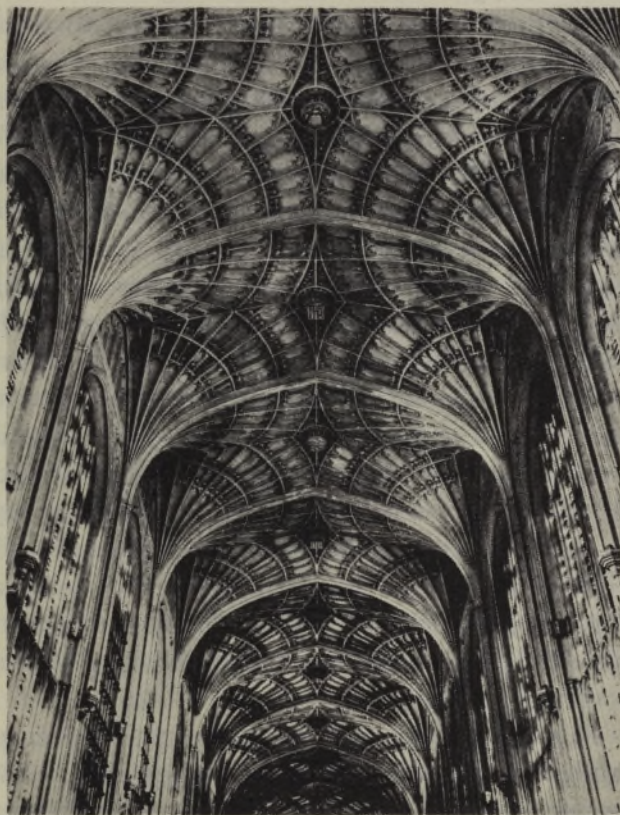
FIGURE 2. The ceiling of King's College Chapel.

the Tudor rose and portcullis. In a sense, this design represents an 'adaptation', but the architectural constraint is clearly primary. The spaces arise as a necessary by-product of fan vaulting; their appropriate use is a secondary effect. Anyone who tried to argue that the structure exists because the alternation of rose and portcullis makes so much sense in a Tudor chapel would be inviting the same ridicule that Voltaire heaped on Dr Pangloss: 'Things cannot be other than they